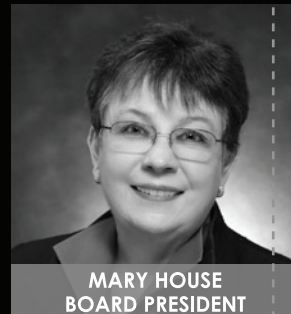
MARY HOUSE BOARD PRESIDENT